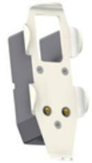
Figure 1: The wall charger

To ensure the batteries are kept in good condition, always put the hoist on charge after use. Never allow the battery to fully discharge.