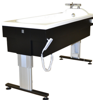
Custom color available on outside